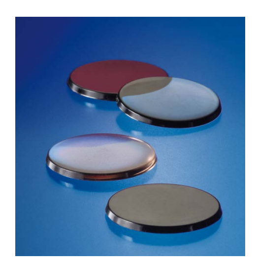
Figure 2: Fused bead samples with different iron concentrations

As described in the Norm, the standards marked with ^{*} were prepared in duplicate. This means a total of 19 standards were used for the calibration. When using NaNO _{3} as an oxidizing agent, the accurate analysis of traces of Na is not possible. If Na becomes important, one needs to change to LiNO _{3} or NH _{4} NO _{3} . The samples are shown in Figure 2.