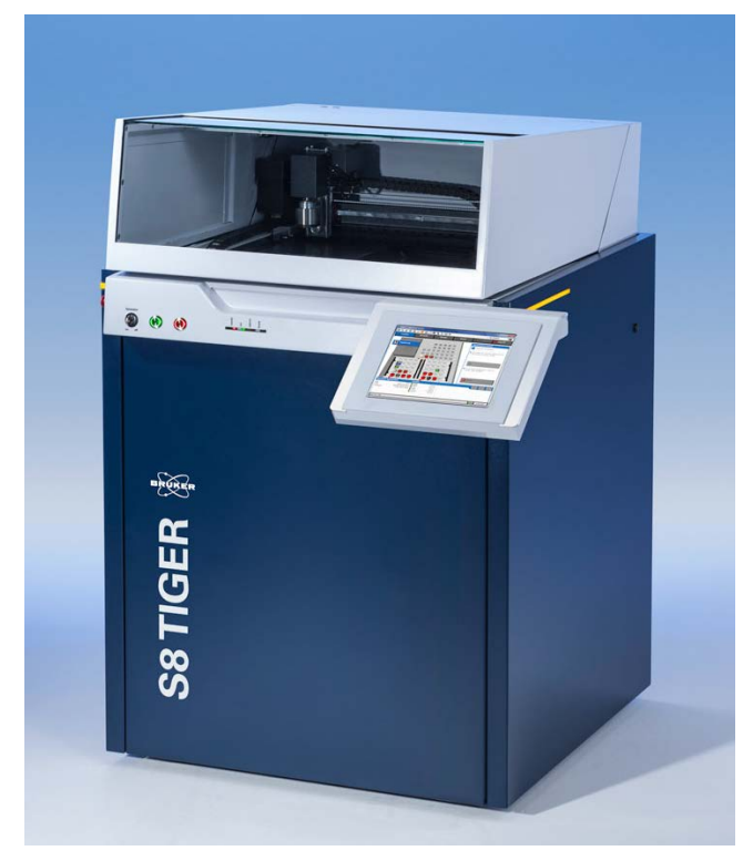
Fig 1: The new S8 TIGER Series 2 sequential wavelength dispersive X-ray fluorescence (WDXRF) spectrometer.

The <u>S8 TIGER Series 2</u> with <u>GEO-QUANT Iron Ore</u> addresses the specific needs for fast grade control of iron ore in geochemical service labs, mine side labs or central labs at steel plants. It starts with the direct loading of samples into the measurement