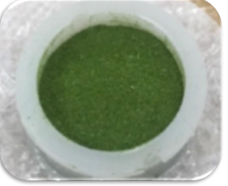
Figure 1a Figure 1b Figures 1a and 1b. Spinach leaves crushed and prepped for analysis; packed in cup

Using an open-ended 42mm XRF sample cup, cover one side with 3µm Prolene<sup>™</sup> film, and clamp it with the