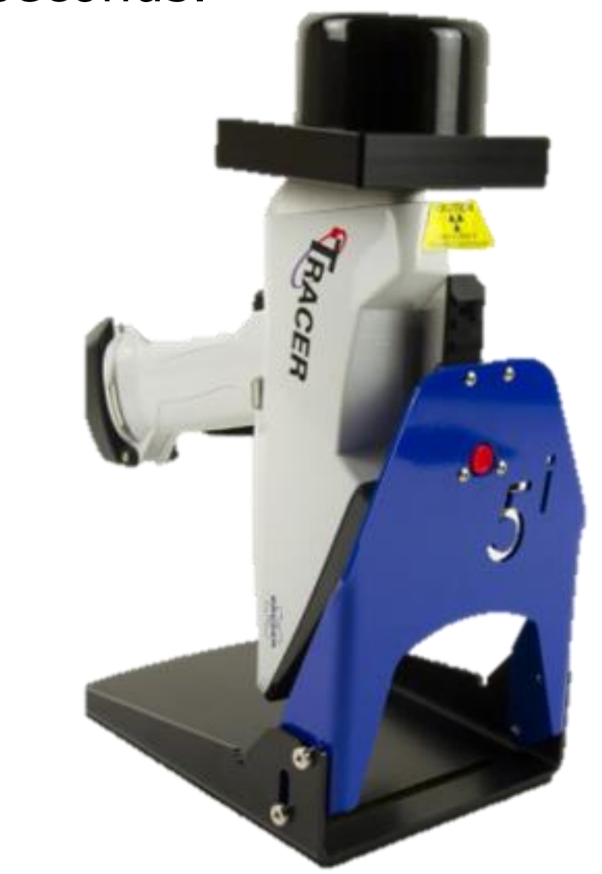
Figure 2. TRACER 5i in desktop stand with sampl under safety cover

To illustrate the impact that sam preparation has on the results, measurements were taken on five fresh spinach leaves before they were dried and prepared. Each fresh leaf was measured at five different locations to assess the "intra" leaf variation, with the leaf laid flat on the sample stage.