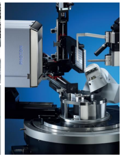
Figure 2: Automating your D8 VENTURE will significantly reduce time-to-structure and increase productivity. SCOUT (I), AGH (c), ISX STAGE (r).