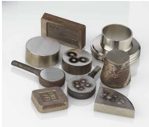
Figure 1: Iron and steel samples