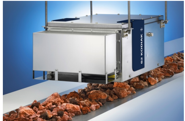
Figure 2: S2 KODIAK online XRF spectrometer on top of conveyed material.

Typically in mining operations, only a few samples are analyzed in a central lab and the results are seen as representative for the entire ship load. But the ore keeps changing, leading to higher variation, and huge differences between the analyzed material and the ore concentration on the vessel are common. When analyzing the material directly during loading with the S2 KODIAK, the exact amounts of base metals in the shipped material is known. This is a source for high savings in shipping costs.