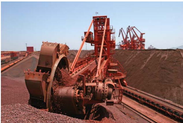
Figure 1: Iron ore blending and shipping.

The S2 KODIAK is perfectly suited for online process control in mining operations. By measuring the exact material composition at any time, hydro- or pyro-metallurgical processes can be optimized to increase output and enhance separation efficiency. Real-time control of the blending step ensures a constant concentrate composition in support of later refining steps. The S2 KODIAK not only analyzes major and minor elements, it also delivers information about hazardous trace elements, such as As or Pb. Low-quality material can simply be excluded from further processing. The S2 KODIAK works for base metal ores, such as iron, nickel, copper, chromium, molybdenum, titanium, tungsten and delivers immediate results for all of them.