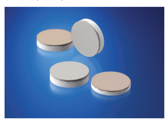
Figure 1: Pressed pellets.

A 21-hours repetition test demonstrates the impressive precision and stability of the S6 JAGUAR (Figure 3 and Table 3). After each analysis, the sample was unloaded from the sample chamber and re-loaded 1 hour later. Particularly remarkable are the very low standard deviations for Fe, Mg, Mn, and Na. A comparison of the measured concentrations to the certified composition reveals an excellent accuracy for these product critical elements (Table 4).