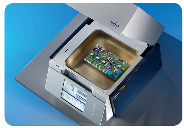
Figure 1: The S2 PUMA – the all-round EDXRF instrument

The non-destructive analysis of small particles is an important analytical technique with a wide range of applications. Many dedicated instruments have been engineered to master such applications. But all of them are specialized products and many