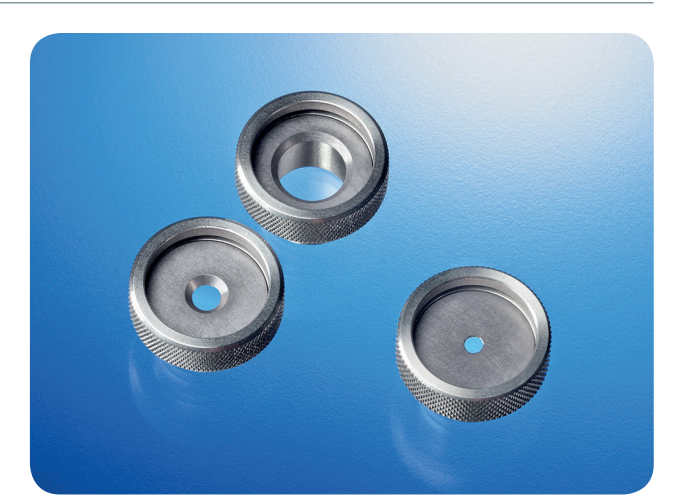
Figure 3: Easily replaceable collimator masks in different sizes