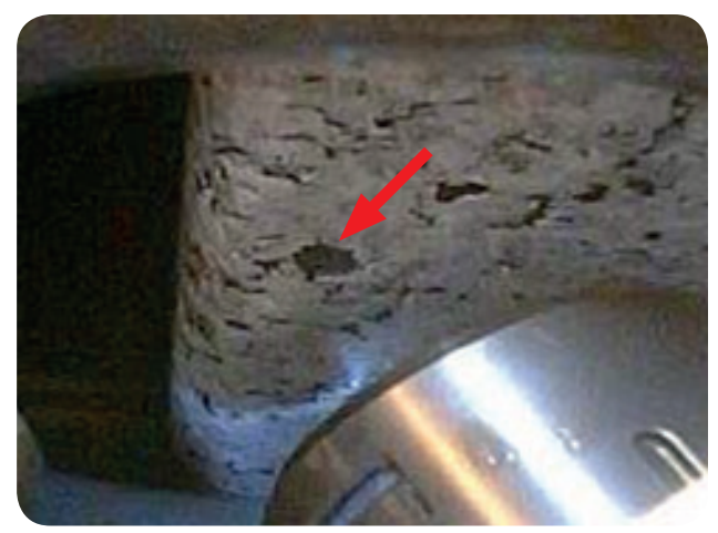
Figure 5: Black biotite crystal (cf. red arrow) within bulk rock sample