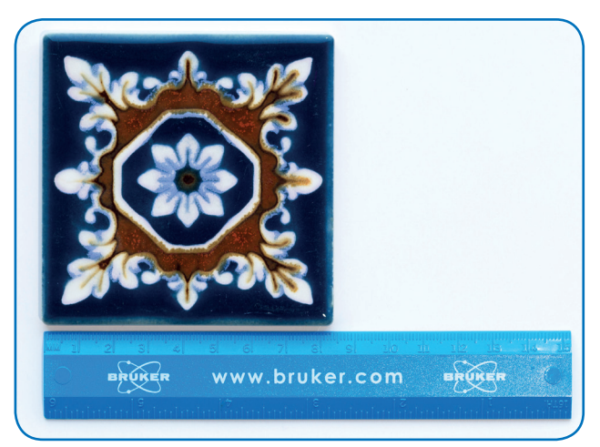
Figure 6: Three-colour design tile

Table 4 below lists the standardlessly obtained values for the brown, white, and blue areas of the sample. The measurement conditions are listed in Table 1. While the brown and white areas show similar values for Zn and Pb, the brown colour contains more Fe and less Mg and Zr compared to the white dye. The blue colour, however, shows elevated values for Co and Zn compared to numbers from brown and white areas.