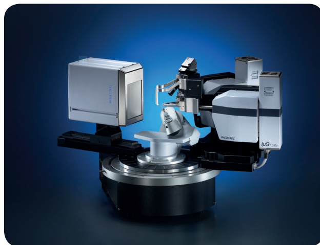
Figure 1: Dual-source configuration with Mo IpS 3.0, Cu IpS 3.0, KAPPA, and PHOTON II.

Finally, the new IpS 3.0 is the first and only microfocus source to feature a hermetically-sealed, Helium-purged beampath. This eliminates the expensive waste of Helium in open-purged designs or the vacuum pump needed in other conventional sources (which is a potential failure mechanism and also a source of vibrations). Purging the entire beam path also significantly reduces air absorption.