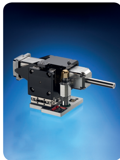
Figure 4: HELIOS optics, Helium-filled and hermetically sealed.